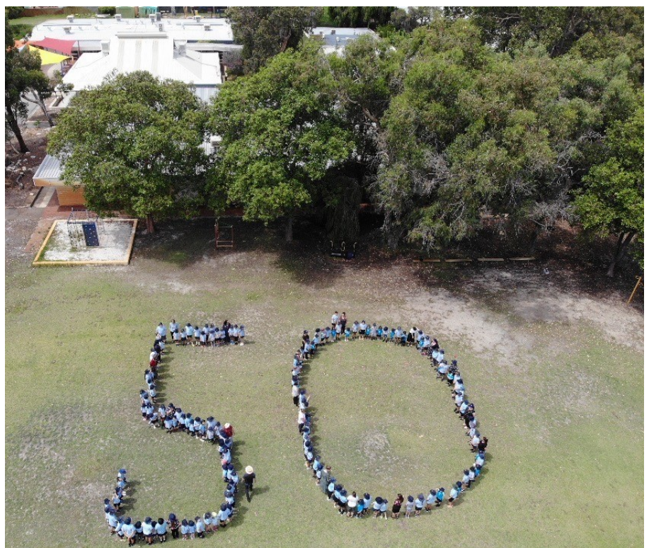
Photo taken last week of all students.