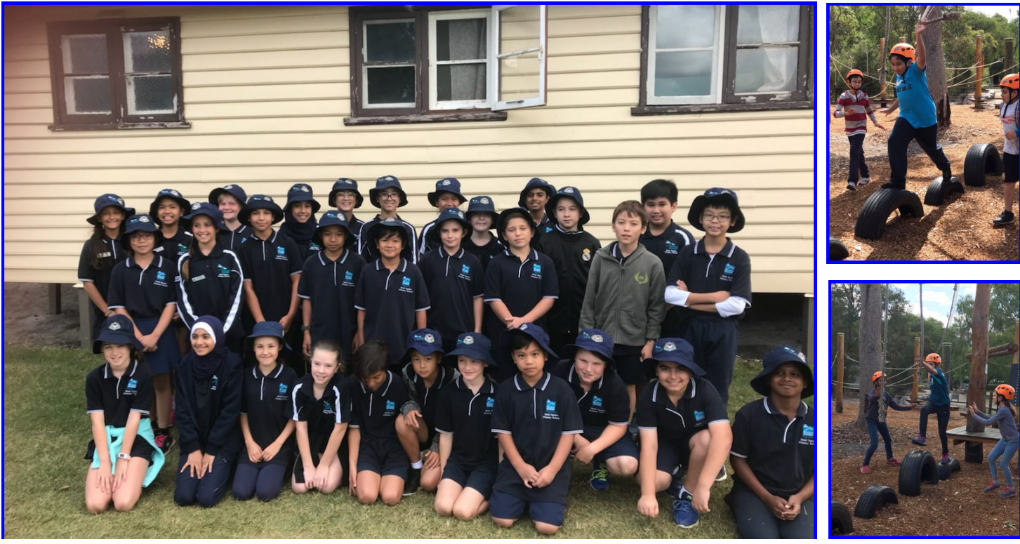
The happy campers at the Kerem Adventure Camp in Bullsbrook!